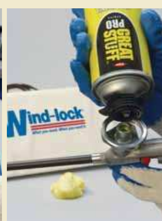
5. Attach can to gun. Always point the can away from your face.