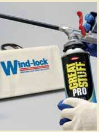
2. Always point the can away from your face.