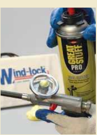
4. After removing the can from gun, clean the gun adapter with the Dow* Cleaner.