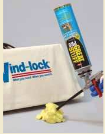
3. Shake can for 1 minute and immediately purge the air from gun.