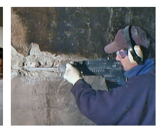
Rehabilitation Patch'n Plug & Megamix