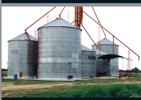
Calafate S.A. Cereal Storage Silos, Argentina