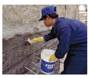
Coating Concentrate & Modified

Xypex's coating systems and repair products enable owners, engineers and contractors to economically and confidently repair structures damaged by water ingress due to hydrostatic pressure, acid and sulphate attack or exposure to aggressive chemicals. Xypex Concentrate and Modified are applied as slurry coatings to the concrete's surface. Unlike other materials that need a dry substrate, Xypex products require a moist surface. This type of environment is conducive to the Xypex Crystalline process. Xypex Patch'n Plug, Concentrate Dry-Pac and Megamix products are specifically designed to permanently repair concrete defects such as static cracks and faulty cold or construction joints. Xypex Megamix returns structural integrity to severely damaged concrete, whilst maintaining the same protective properties of Xypex-treated concrete.